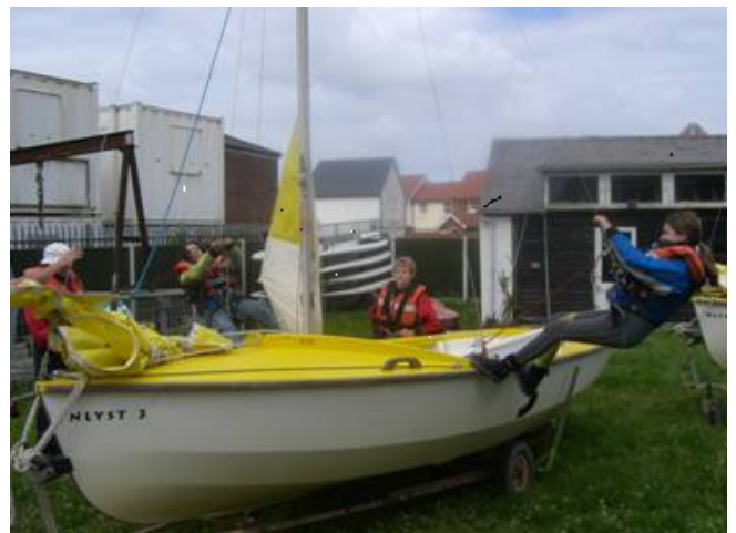
Trapezing on dry land!