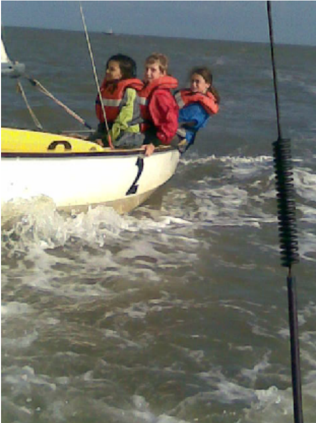
Racing the parents home!